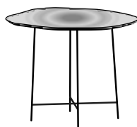
occasional table high version